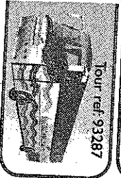
Tour ref: 93287